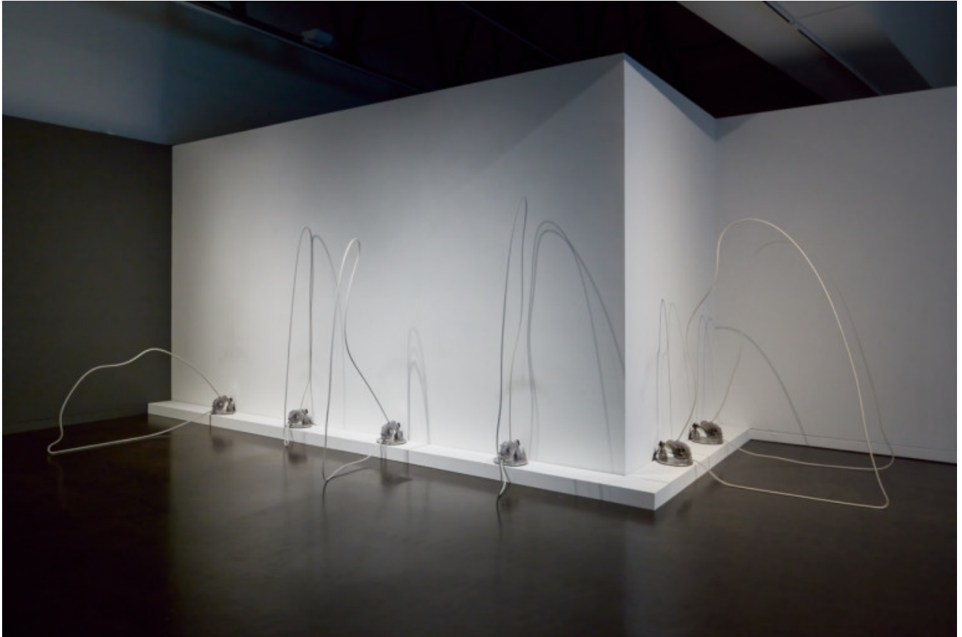
Paolo Salvagione, "Rope Fountain" (2015), nylon rope, 3D printed housing, motors, control electronics, code, variable dimensions

and coding methodology have become so intermingled, it's no longer advantageous to elucidate their differences.